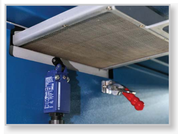
Easy-to-reach filters, belt replacement & lubrication points